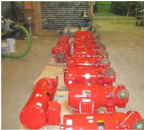
Above: A batch of ITT Goulds® 3655M USCG Fire Pumps; tested, certified, ready to be packaged and shipped out.

Our Warranty covers all parts and labor.