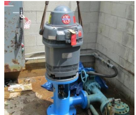
Above: A Gould's Turbine Pump for a snow maker at a recreational ski hill.

We utilize genuine Original Equipment Manufactured parts whenever possible to help ensure all overhauled equipment is returned to a like new condition.